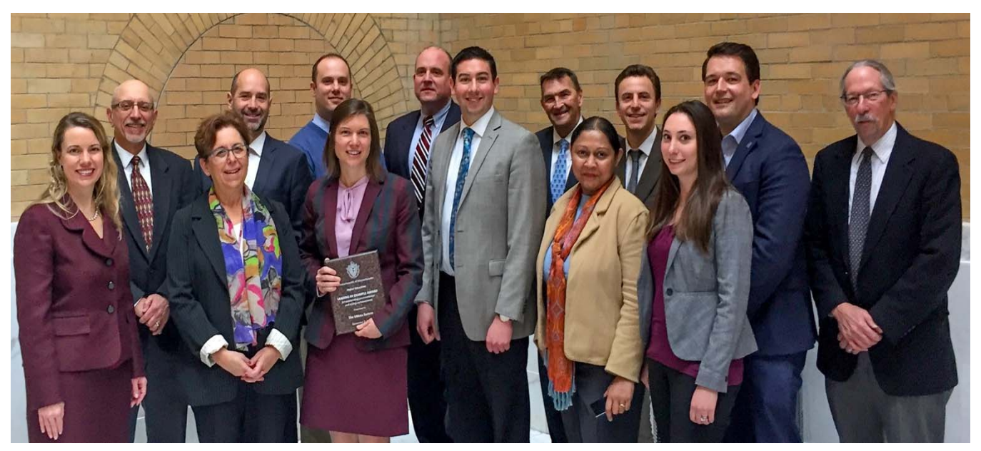
MEMBERS OF THE UMASS SUSTAINABILITY COUNCIL RECEIVE THE 2016 LEADING BY EXAMPLE AWARD FROM THE DEPARTMENT OF ENERGY RESOURCES.

The UMass Sustainability Council was recognized in the last round of awards for our continued and collective efforts as active members of the Leading By Example Council. Here is an excerpt from the award announcement: